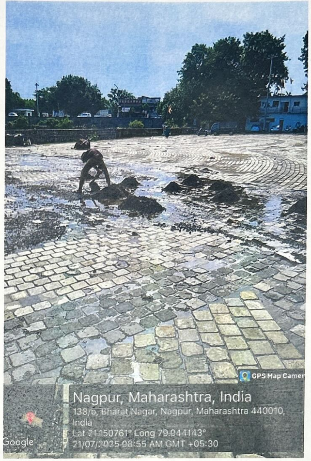
GPS Map Camera Nagpur, Maharashtra, India 138/5, Bharat Nagar, Nagpur, Maharashtra 440010, India Lat 21.150761° Long 79.044143° 21/07/2025 08:55 AM GMT +05:30 Google