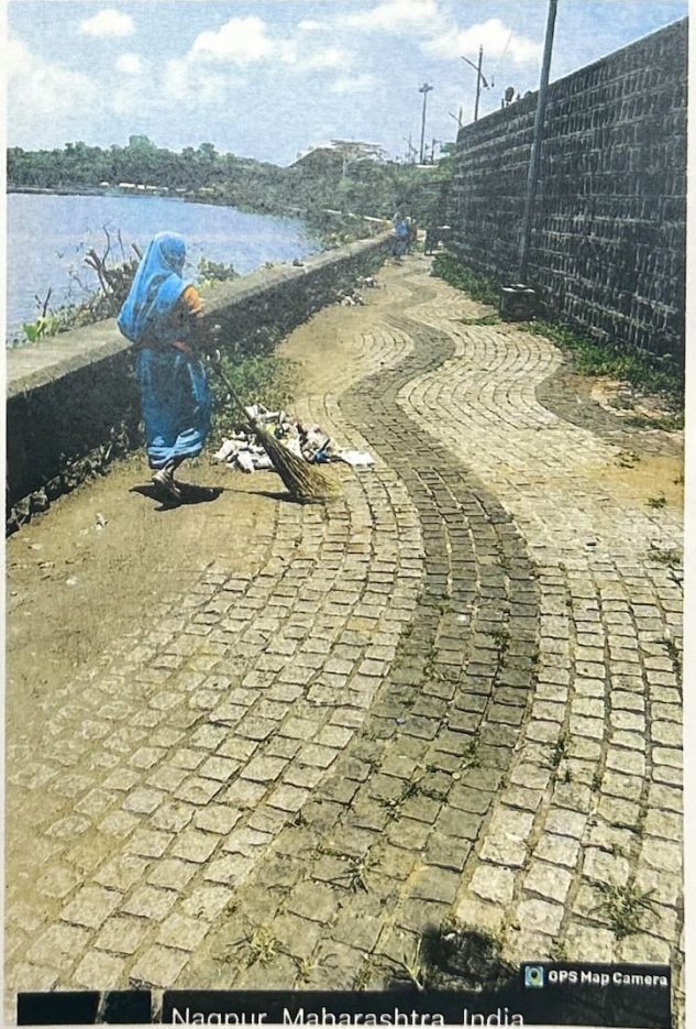
GPS Map Camera Nagpur, Maharashtra, India