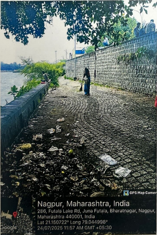
Nagpur, Maharashtra, India 286, Futala Lake Rd, Juna Futala, Bharatnagar, Nagpur, Maharashtra 440001, India Lat 21.150722° Long 79.044998° 24/07/2025 11:57 AM GMT +05:30 Google